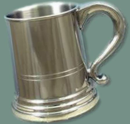
Pub Mug $250