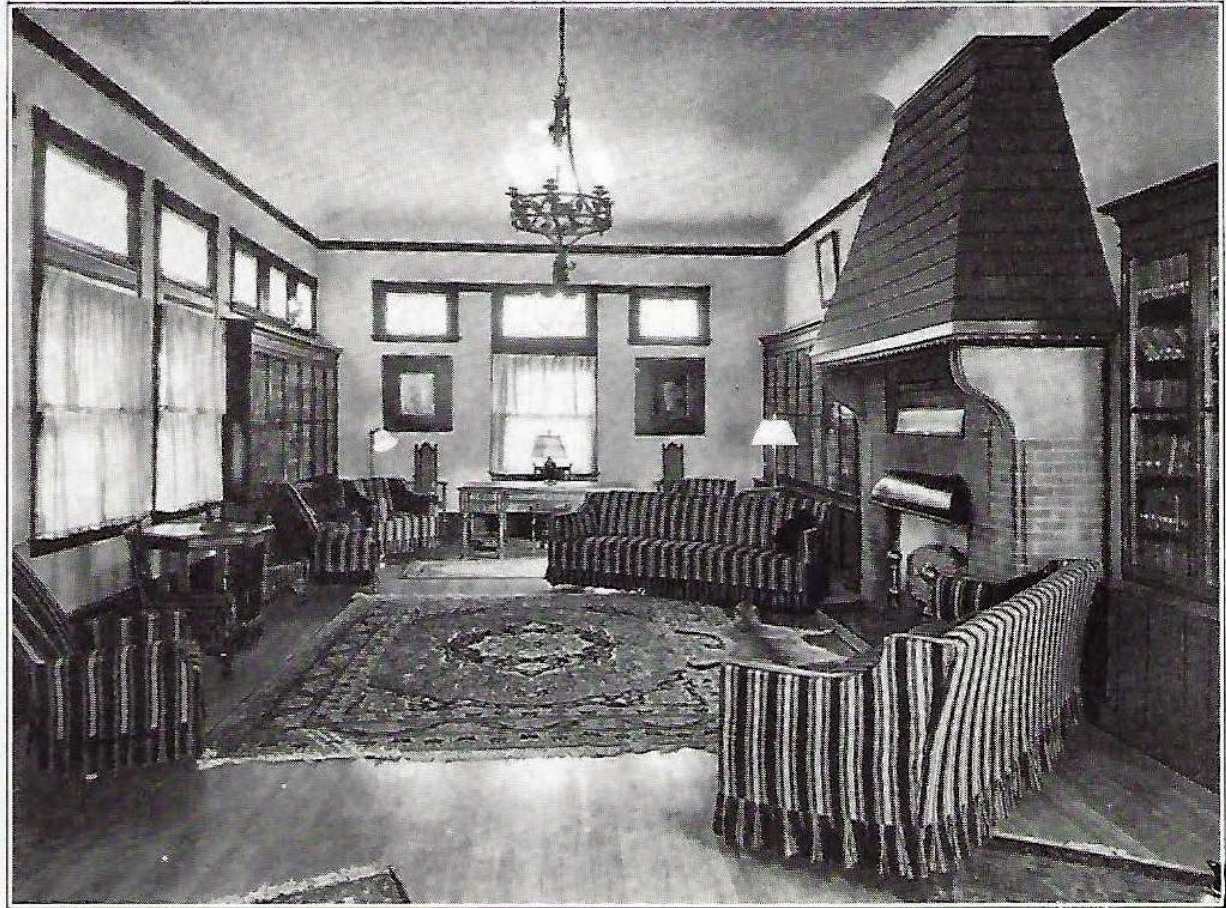
MEN'S LOUNGE ROOM