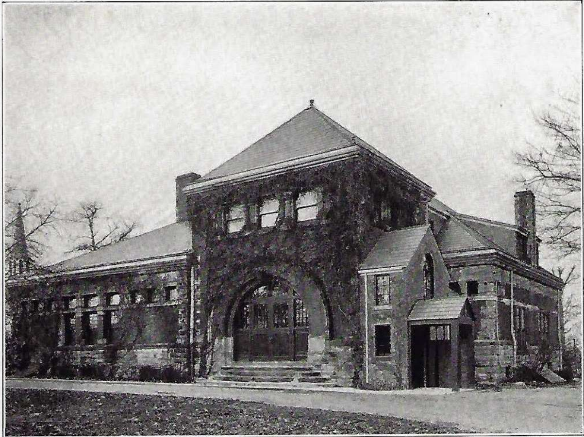
THE LYCEUM BUILDING. BUILT 1887. REMODELED 1929.