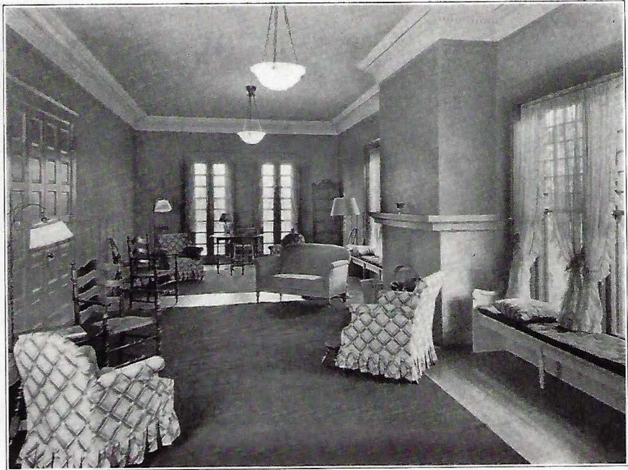
LADIES' RECEPTION ROOM